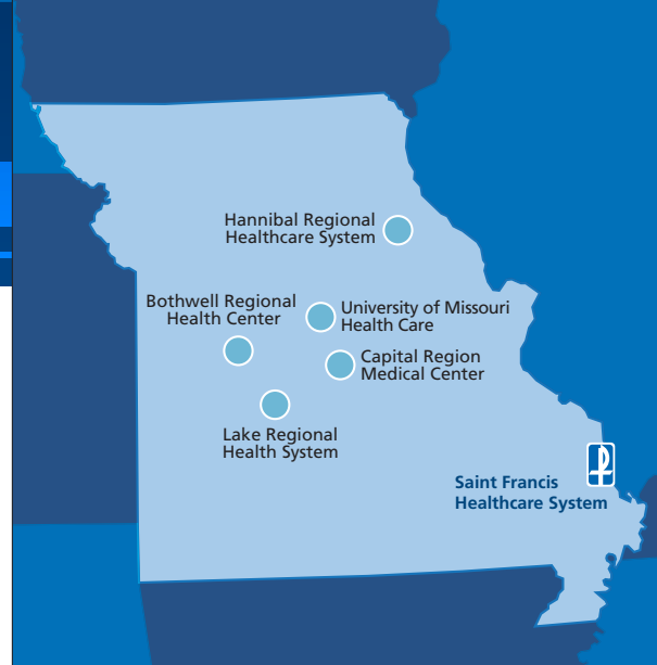
Health Network of Missouri Members