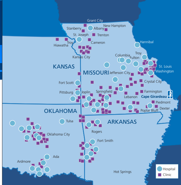
MPact Health Alliance Map